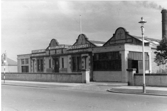
Dunfermline & West Fife Laundry – c.1940